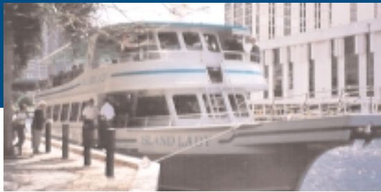
Boarding The Island Lady for a tour of the Miami River