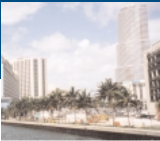
The downtown Miami skyline as seen from the Miami River entrance